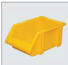
Multi Tool Box Item Code: MTB1288Y