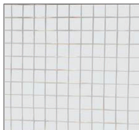
Wire Mesh Item Code: WM3x4B