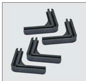
AP Slim Stopper Item Code: NH4A