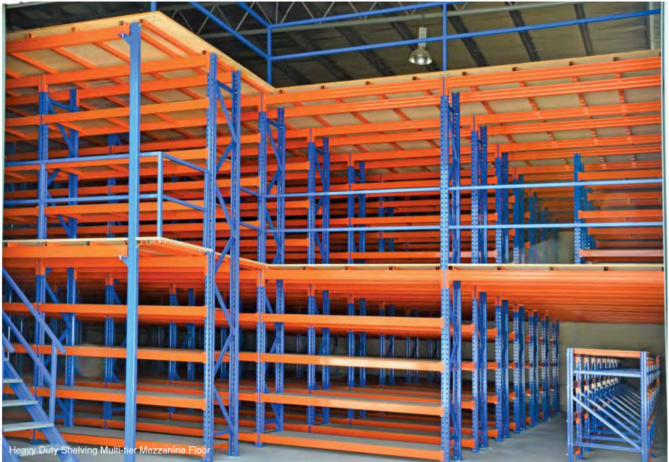
Heavy Duty Shelving Multi-tier Mezzanine Floor