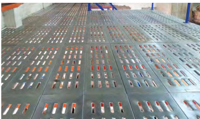
Perforated Metal Floor Plain