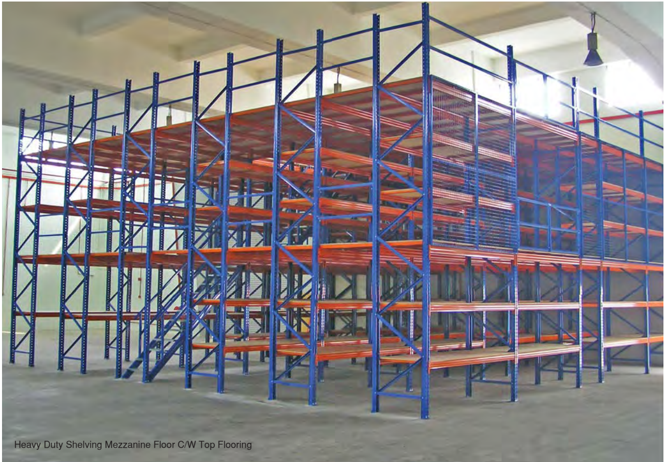
Heavy Duty Shelving Mezzanine Floor C/W Top Flooring