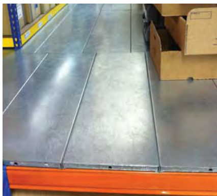
Metal Floor Plain